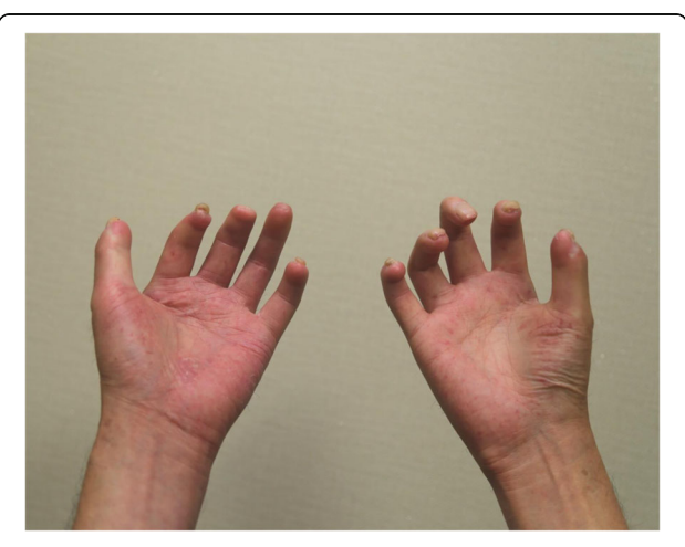
Fig. 1 Hands of Case 1. All the fingers of this patient's hands show joint contractures, and the distal phalanx of the left third finger was self-amputated

The patient worked in crystal processing in the jewelryprocessing industry for 17 years from the age of 17 years in 1976 to January 1994. In 1984, he was first diagnosed with pulmonary tuberculosis, which recurred but was cured in 2000. He first experienced Raynaud's phenomenon of both the hands and feet in 1991. He had a chest tube inserted in 1993 due to left pneumothorax. In approximately the year 2000, he developed digital cyanosis and hardening. In April 2006, he reported swelling, pain, and gangrenous lesions of the right great toe and left third finger. He subsequently presented to a local university hospital, where he was first diagnosed with systemic sclerosis. His symptoms progressed to digital contracture and auto-amputation of the distal phalanx of the left third finger due to necrosis.